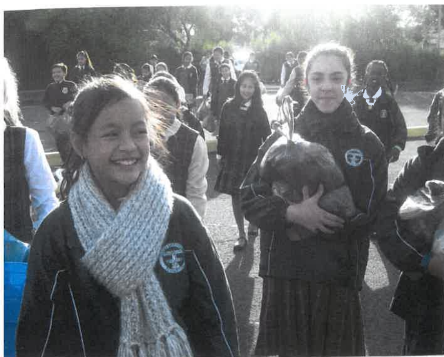
Mini-Vinnies Winter Food Appeal