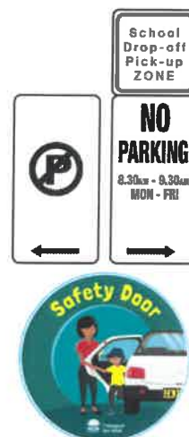
Kids and Traffic Safety Door sticker RTA45091021K