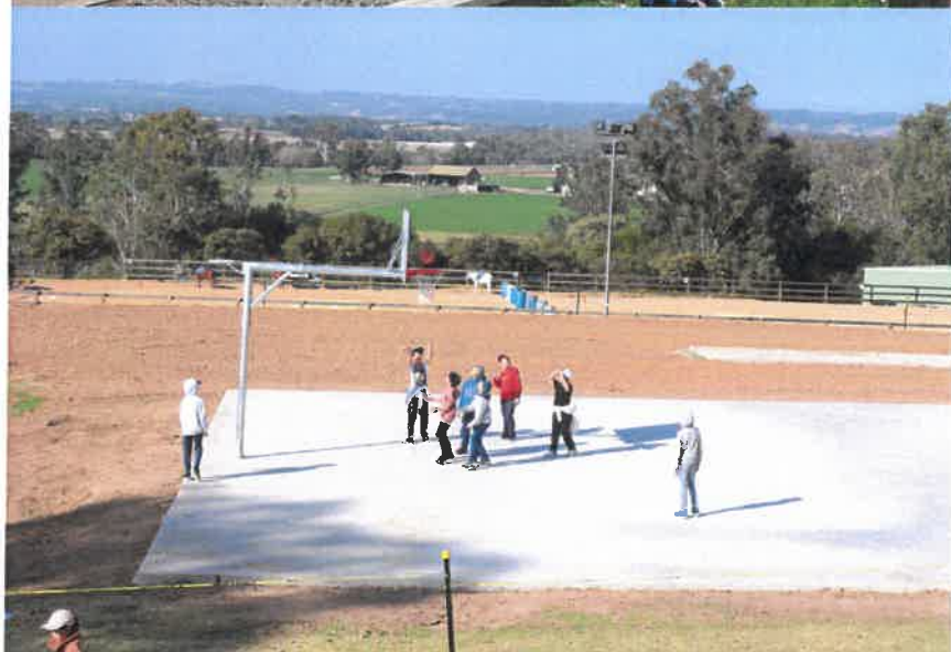
2019 Teen Ranch !!