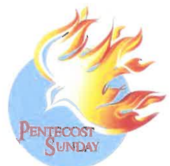
Tricia Carr Principal

and to make positive use of them in our daily activities. Amen."